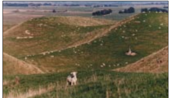
Grazing stock favor flatter ground in hilly pastures, particularly the ridge-tops.

Hilly land, by its very nature, has areas of differing slope and aspect. The rugged landscape in which one of the surveys from this study was conducted is illustrated in the photo. Areas facing the sun are warmer than areas on the shady side of the hill. Rainfall tends to run off steep spurs and ridges and collect in hollows and flatter areas. These contrasts in relief and microclimate can result in three- and four-fold differences in the amount of pasture grown in different areas of the paddock. This will have major implications for the amount of K taken up by the pasture plants and the amount transferred away by grazing animals.