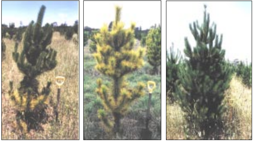
Figure 3. The same K deficient tree at ages 2, 2.5 and 3 years (left to right). This tree received no weed control or fertilizer. Yellowing due to K deficiency increased with drought (2.5 years) but decreased when the drought broke (3 years).

2 m wide strips along tree rows. Expert advice should be sought to identify sites at risk of K deficiency and to develop site-specific recommendations.